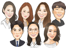
<LOTTEJTB IBERO TEAM>

We, LOTTEJTB are excited to announce that our team will be participating in FITUR 2026, taking place from Jan 21st - 25th in Madrid. This is great opportunity to connect with us and explore future collaborations.