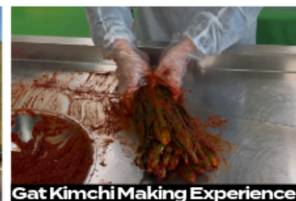
Gat Kimchi Making Experience