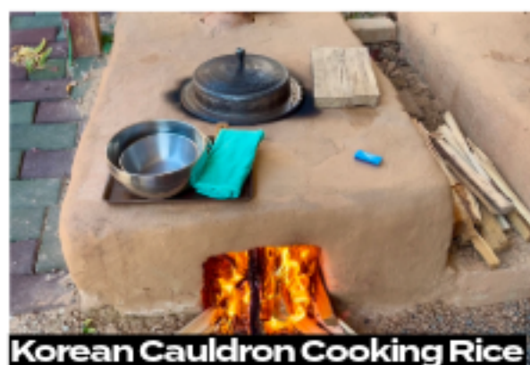
Korean Cauldron Cooking Rice