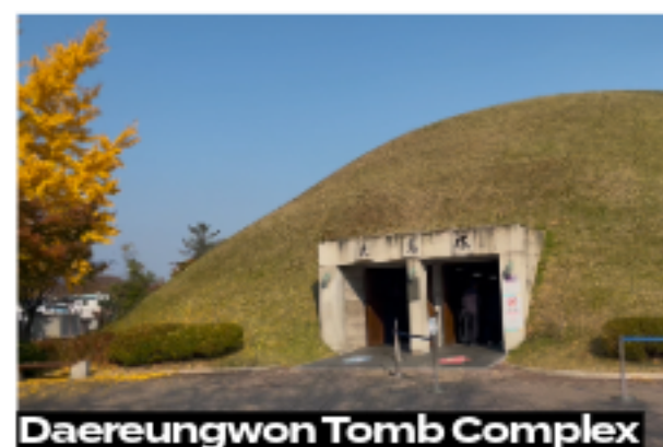
Daereungwon Tomb Complex